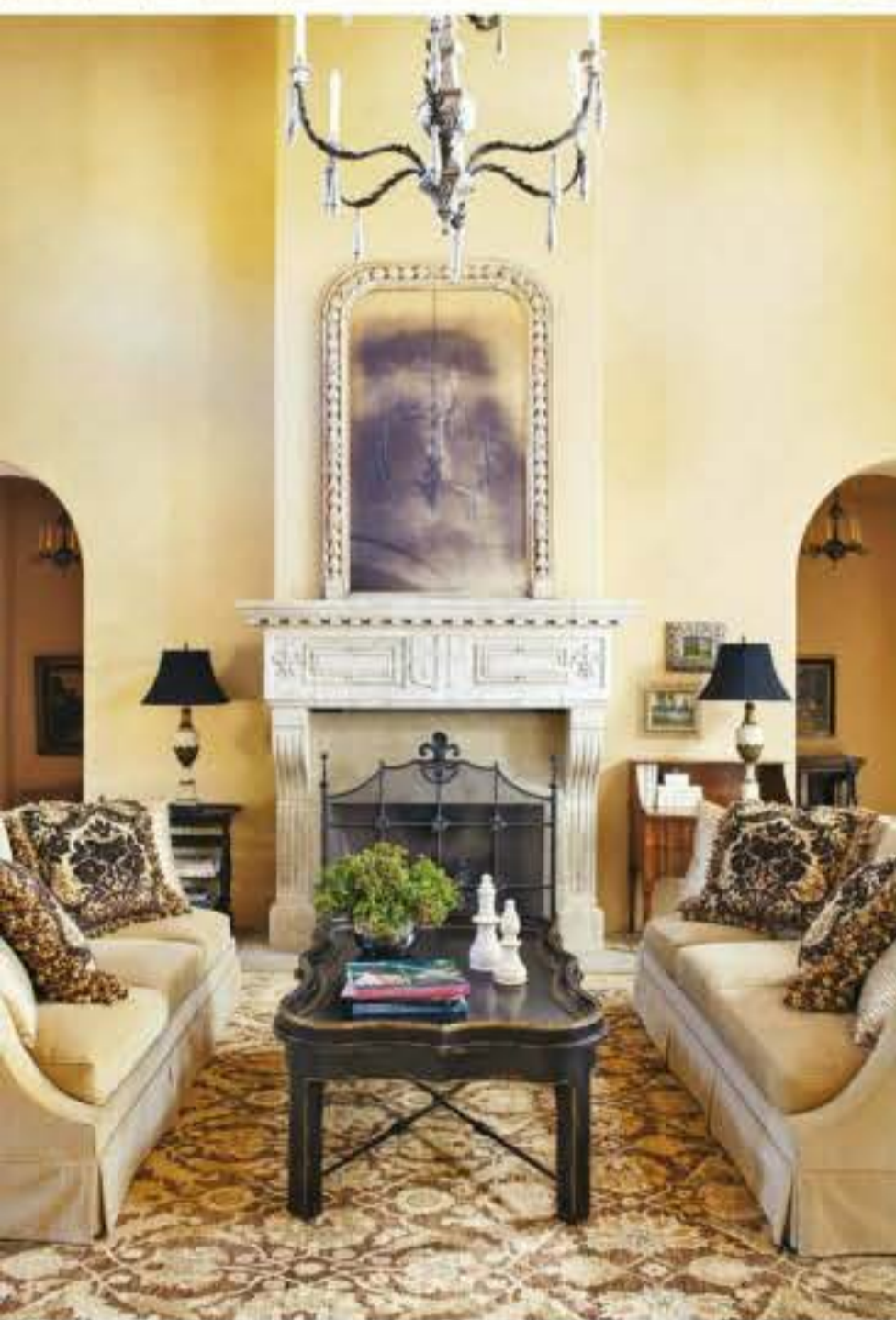
TOP: To capitalize on every available inch of outdoor living space, the home features a low-profile facade that provides privacy for a spacious front courtyard. ABOVE: Integral color plaster walls in the living room recede to allow understated sofas, a gesso-finish coffee table, and a lime-washed mirror above the limestone fireplace to take center stage.