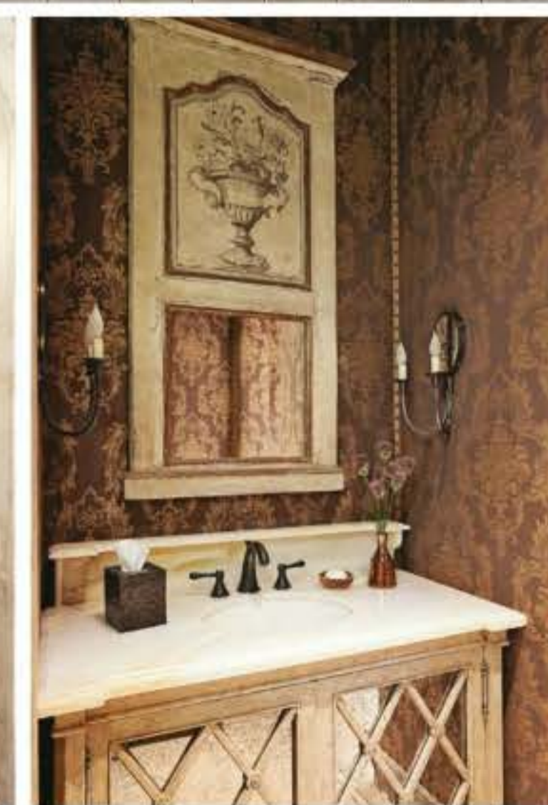
ABOVE: Leathered black granite countertops cap antique-glazed perimeter cabinets in the kitchen, while a distressed black-painted island crowned with limestone provides ample prep and entertaining space. The range is defined by hand-glazed backsplash tiles and a plaster mantel hood. FAR LEFT: A climate-controlled wine room located between the kitchen and formal dining room features an arched glass-and-wrought-iron door inset into a limestone framework. LEFT: Damask-upholstered walls trimmed with French grosgrain lend the powder room a jewel-box-like feel.