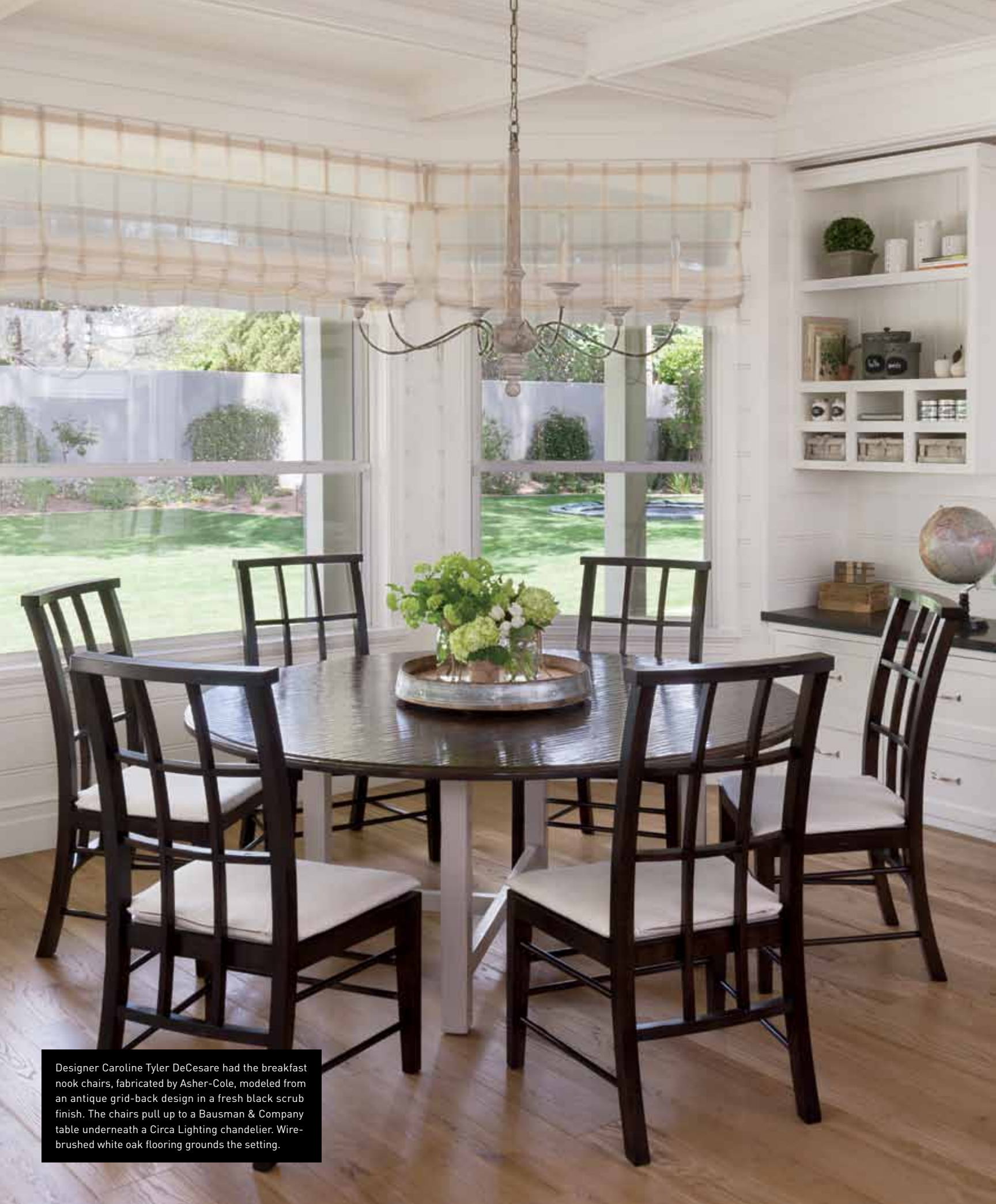
Designer Caroline Tyler DeCesare had the breakfast nook chairs, fabricated by Asher-Cole, modeled from an antique grid-back design in a fresh black scrub finish. The chairs pull up to a Bausman & Company table underneath a Circa Lighting chandelier. Wire-brushed white oak flooring grounds the setting.